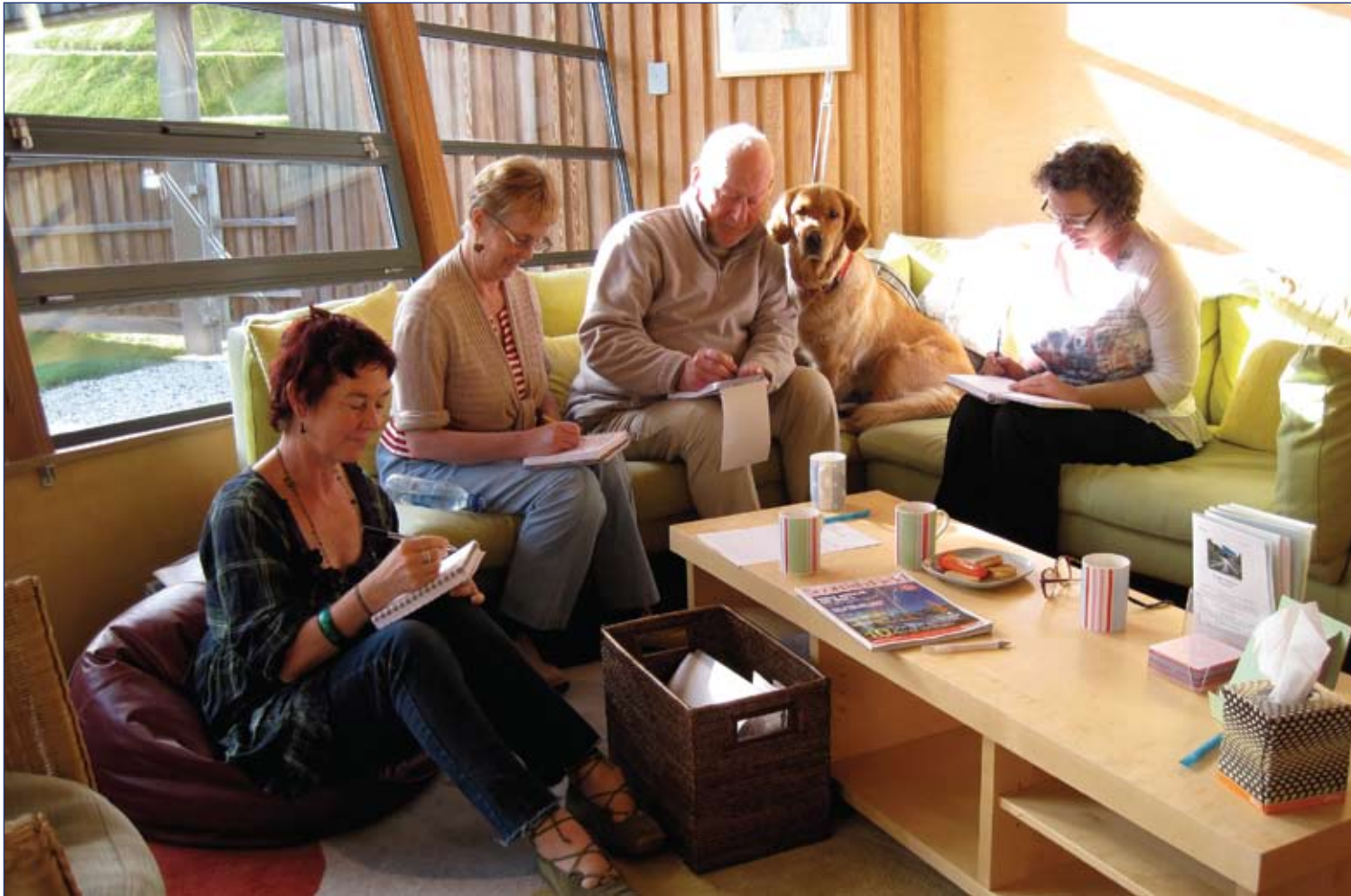
Writing at Maggie's (the dog's still working on its novel).

What is writing for? A good story or poem can entertain, it may make us laugh out loud, or move us to tears, or even turn our whole worldview upside down. For the writer, the act of setting down words on paper (or a computer screen) can be a joyful release of creative energy, a determined pursuit of the truth, or the lasting satisfaction of having created people and places that live on the page. But can writing help us to stay healthy, in mind and body? Northwords Now asked three writers whose working lives embrace the creative and the therapeutic dimensions of writing to speak of their experience.