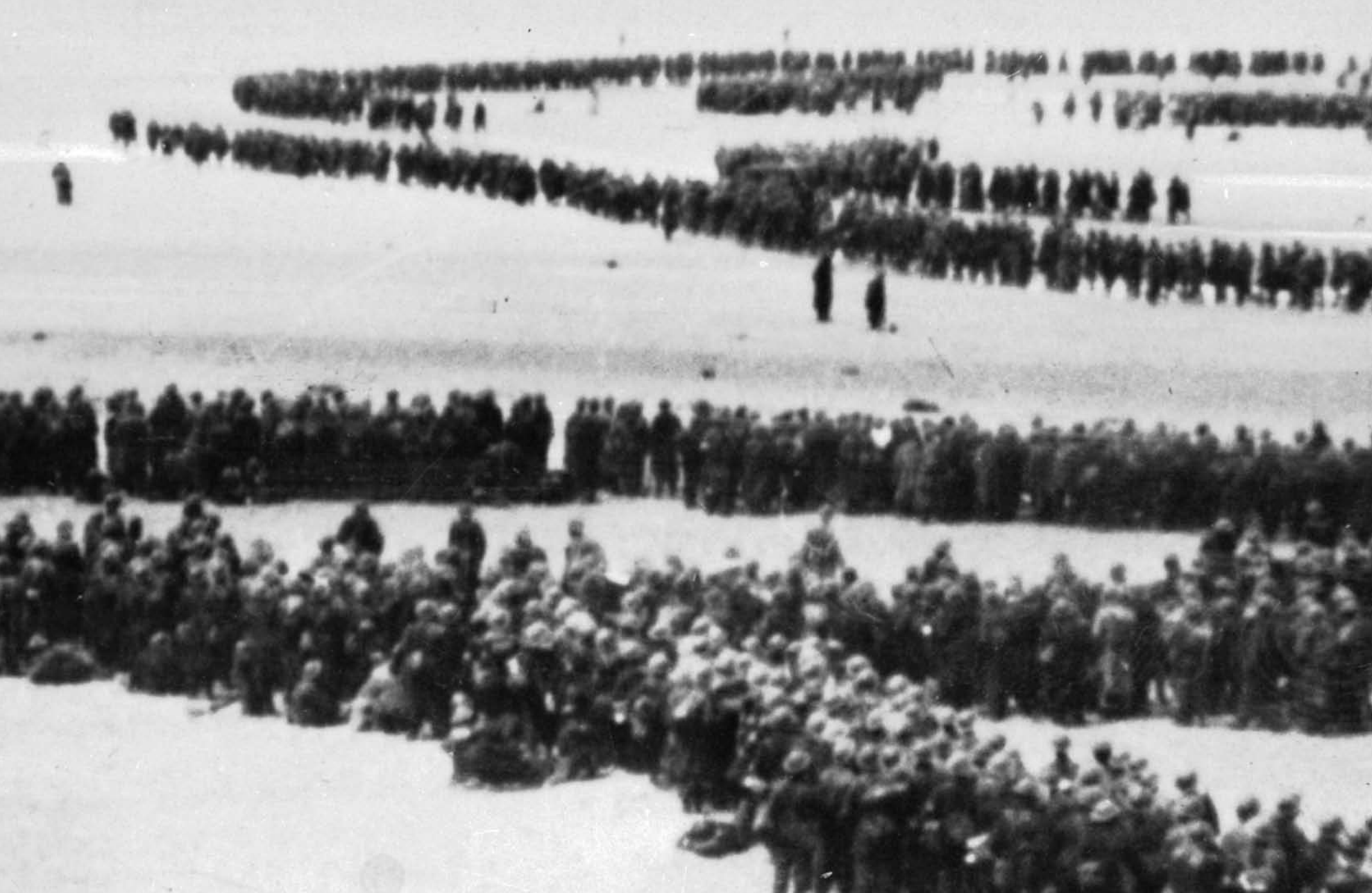
British troops line up on the beach at Dunkirk to await evacuation