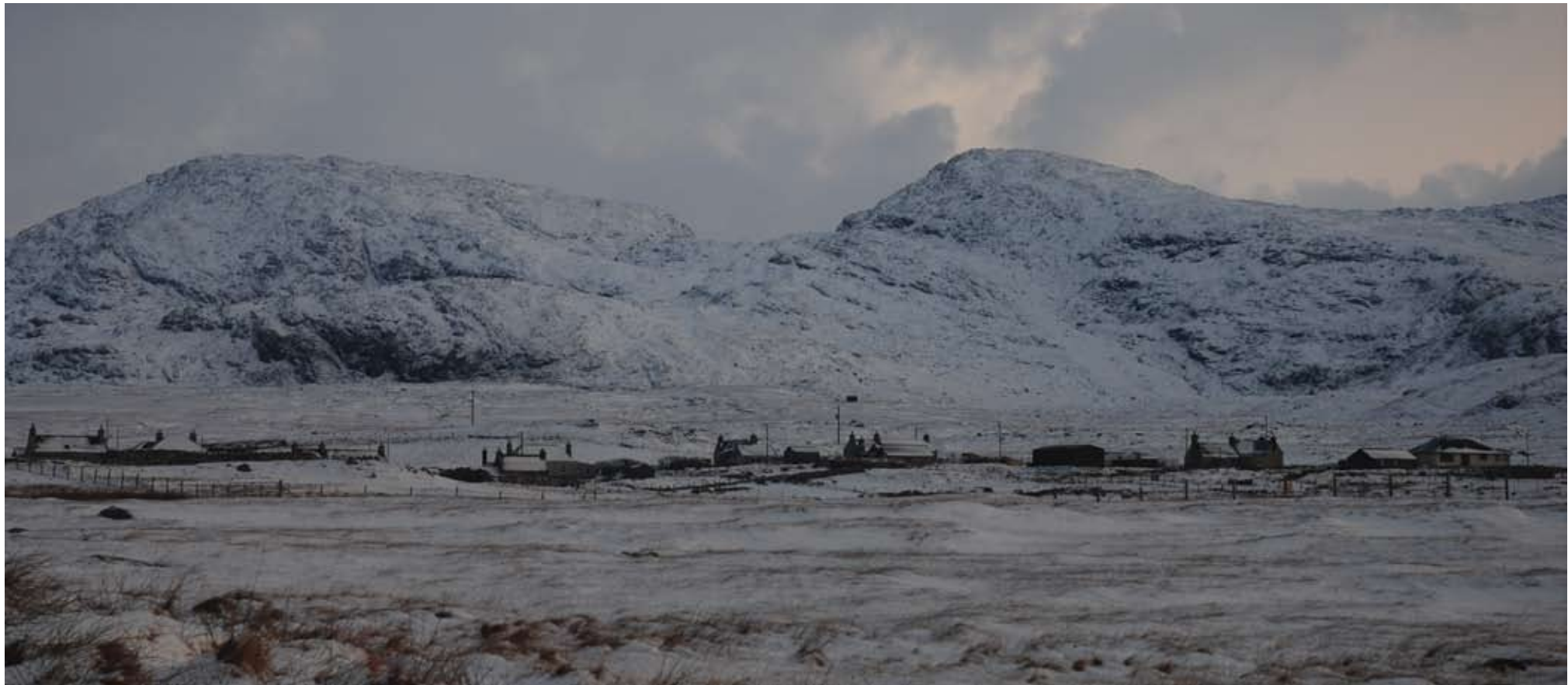
Who needs Edinburgh? The view from Two Ravens Press